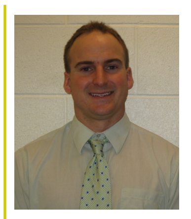
"Let's hold our heads high, take some pride in what we do, and know that we all make a difference."

"Share the Classroom Treasures" has been a huge success at recent conferences. It is amazing the number of items that change hands! What a wonderful way to support one another. As you sort things and get organized for the school year, don't toss things that may be of use to a fellow teacher. You can bring your "Treasures" that are no longer of use to yourself...to the conference next February.